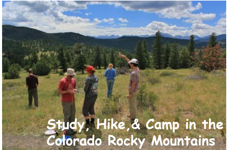
Study, Hike, & Camp in the Colorado Rocky Mountains